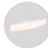
BLANCO / WHITE