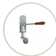
RUEDA / CASTOR 86 puntos / 86 points