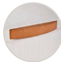
CEREZO / CHERRY