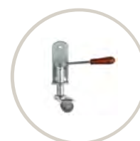
RUEDA / CASTOR 86 PUNTOS / 86 POINTS

Tapa reforzada con 4 travesaños horizontales. Reinforced cover with 4 horizontal slats.