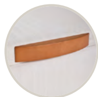
CEREZO / CHERRY