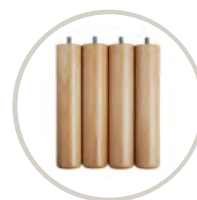
NATURAL / NATURAL