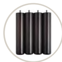
WENGUE / WENGE