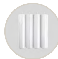
BLANCO / WHITE