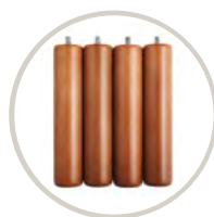
CEREZO / CHERRY