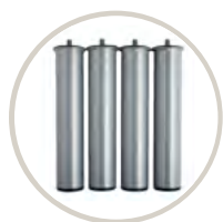
TAPI / TAPI